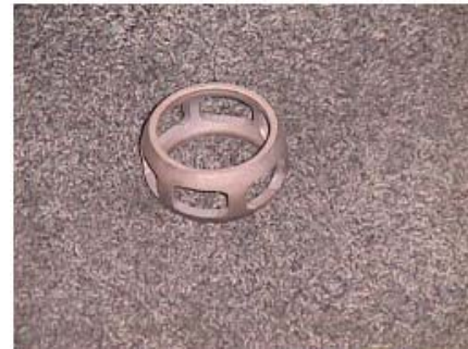
Fig. 3 AISI 8617 steel bearing cage used for automotive CV joints.

The resulting micro hardness distribution of two standard production bearing cages and a 50% reduced-time/intensively quenched cage are summarized in Figure 4 [1]. The surface hardness of the intensively quenched bearing cage was 2-5 HRC greater than that obtained for the standard production cages. At the HRC = 50 point, the intensively quenched part exhibited a significantly better hardness profile while still having an acceptable distortion [1,2].