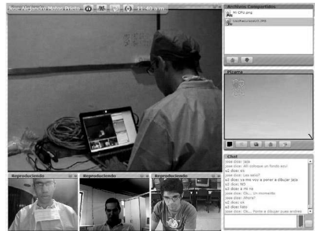
Fig. 6. Display of the test session from different locations.

that the facilitator chooses to share which will further benefit the evaluation. In addition to all of this, the component Design of Online Assessments enables the selection of day and time for the evaluation as well as determining how long it will remain open. Fig. 8 shows a screen of this section.