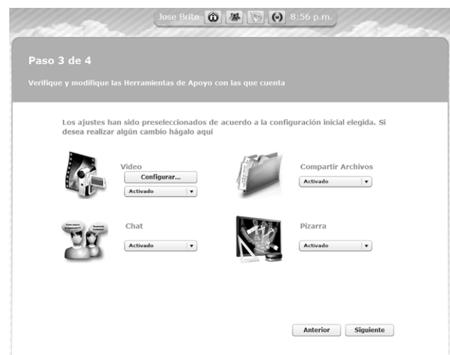
Fig. 3. A screenshot of the step to configure the elements available during the operation.

open source software development that translates messages coded in Action Message Format (AMF) to PHP language, which is the coding used in applications that are developed using FLEX® to send and receive data through a network. Finally, the main function of the FMIS component, which is labelled as (g), is to offer real-time communication services between different instances of (a) and (b). These services include real-time two-way audio and video transmission, on-demand video transmission, shared objects that enable the users to interact simultaneously with chat and the whiteboard, and the data that the different instances of (a) and (b) use to keep synchronized. The communication to and from (g) is coded in AMF. Therefore, (a) and (b) communicate with (g) with no need for an intermediate translator. This system uses configurable quality video transmission (that can be adapted to the network bandwidth), with signals from the various devices and equipment used in surgical operations. Thus, specialists in front of computers at remote sites that are interconnected by the network can observe and interact with the surgeon facilitator before, during and after the operation. The tool has elements for multimedia video editing and for live two-way transmission of audio and video. In addition, it uses a database manager to store information that is generated and input.