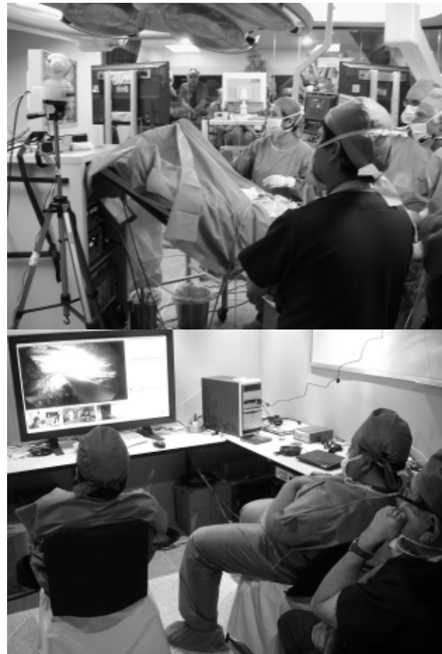
Fig. 1. Two planes during a test of the RSS during a live session: at the top shows the surgical act and at the bottom the participation of three urologists during one of the test sessions system.

Console on the Operations Centre server of the Integrated Digital Backbone of the University of Carabobo (COR REDIUC) and on the console monitors in the workstations.